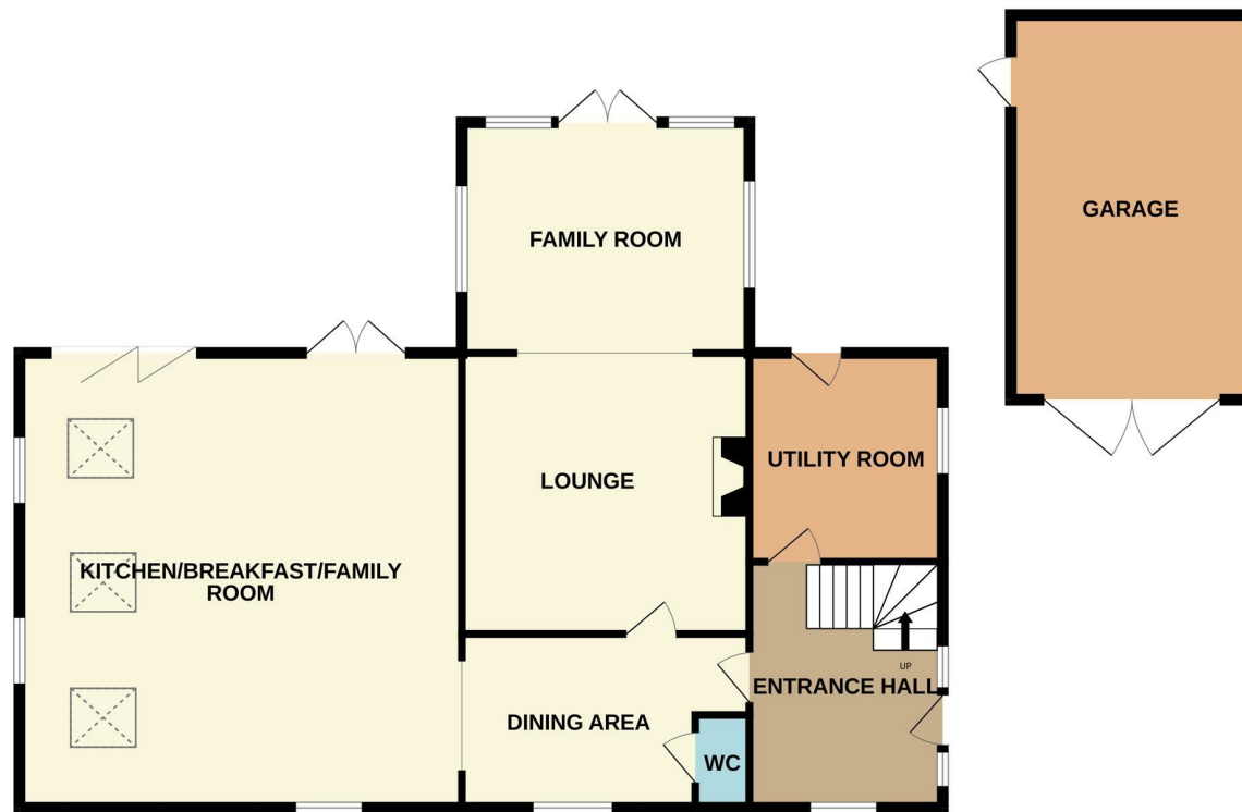
GROUND FLOOR 1457 sq.ft. (135.3 sq.m.) approx.